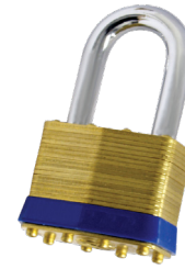
Left to right: 4124-97, 4014-25