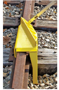
4014-07-S Right Throw

The one-way portable derails are used for freight cars and all size locomotives (rails 90–141 lbs, wooden ties, tie spacing: 18–24"). The two-way portable derails are for freight cars and 4-axle locomotives only. Do not use two-way with 6-axle locomotives (rails 100–136 lbs wooden ties, tie spacing 19–24").