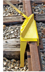
4014-06-S Left Throw