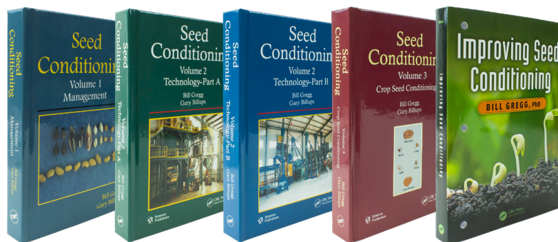
Left to right: SEEDBOOK-I, SEEDBOOK-II (Parts A and B), SEEDBOOK-III, SEEDBOOK-IV

Seed conditioning turns raw harvested seed into pure seed that is free of undesirable materials, safe from pests and diseases, and that which can be planted for a good stand of healthy plants of the desired crop.