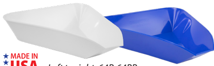
★ MADE IN ★ USA Left to right: 64P, 64BP