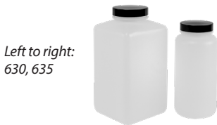
Left to right: 630, 635