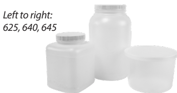
Left to right: 625, 640, 645