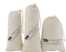
Left to right: 155, 156, 157

These government standard sample bags are made to comply with USDA specifications. The heavy canvas material has a mildew proofing agent to retard deterioration and is treated with a water resistant agent. All bags have a double-stitched drawstring. Private labeling is available - Call for quotation.