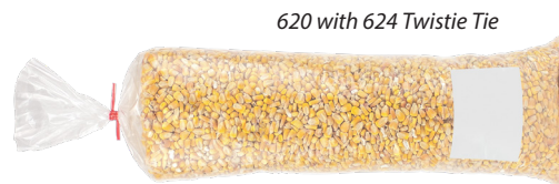
620 with 624 Twistie Tie

Seedburo's "poly" bags are ideal for retaining samples or for sending samples for inspection or evaluation purposes. Can be used separately or as a liner for our canvas grain sample bags (see below). Made of tough, transparent polyethylene, these bags will not become brittle. Bags are odorless, non-toxic and sealable with cable ties or twistie ties. Poly bags sold in lots of 100 or 1000's. Available in sizes specified or in rolls (specify width and thickness).