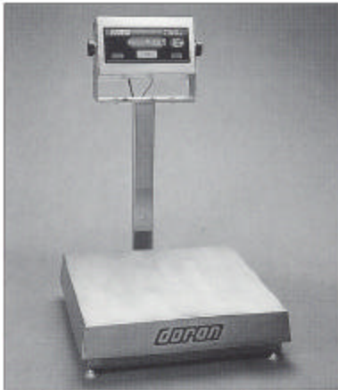
APS7000XL/18S, 18" x 18" Platform

Featuring 304 stainless steel construction and a water resistant design like all Doran Scales, the APS7000XL gives you a versatile and dependable general purpose scale ideal for use in food processing, manufacturing, and shipping applications, to mention just a few! The column mounted indicator provides clear, concise weight readings and a tough mylar touch panel which incorporates not only push-button ZERO, but also UNITS & PRINT features at no extra cost!