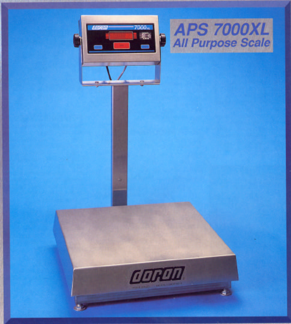
APS 7000XL All Purpose Scale