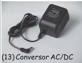
(13) Conversor AC/DC